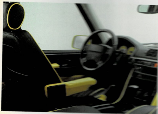
(shows 11, 15 & 16)