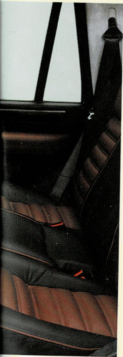
1, 13, 17, 20, 24 & 15)