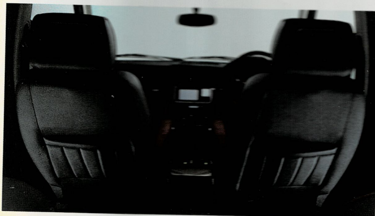
(shows 22 & 25)