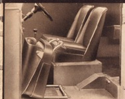
THREE IN FRONT.....ONE BEING A "TIP-UP"