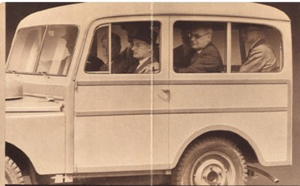
SEVEN Comfortable SEATS...