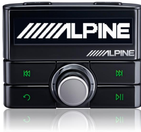
The controller unit

The self-install kit consists of the converter unit which can live out of the way under the dashboard and a small, quite smart looking control unit which can be fitted somewhere within easy reach, and because DAB radio works on a different set of frequencies to the FM system a DAB stick-on a window aerial. All the necessary leads and connectors are also included, although there might be a requirement for a couple of aerial plug adapters for ISO and DIN systems. Depending on where the kit is purchased, the stick-on aerial might or might not be included.