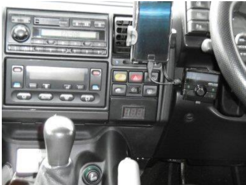
The controller in place

I tend to think that for some but not all people this might be a reasonable way forward, it future-proofs your listening with the latest DAB radio while still retaining your existing FM system, whether it's original or aftermarket. By being able to connect a mobile phone it also give you the capability of connecting to internet radio and streaming services or your own .mp3 playlists and since the only major change to the existing ICE system is a "loop through" in the aerial line, the original remote volume controls will continue to work as they were intended, as does the CD auto-changer/player, amplifier and even the tape player and medium and long wave steam wireless.