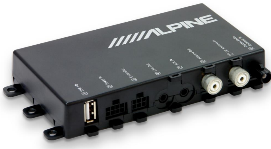
The converter unit

The signal injection scheme is the same as for a wired modulator, that is, in-line with the FM aerial. The converter unit also has a 3.5mm audio input and a USB socket to which your iPod, iPhone or .mp3 player can be connected, it can power other non-Apple devices such as Samsung. You could even use a USB Flash drive or a hard disk drive. The USB socket is also required for updating the device. There is also a 3.5mm output too for connecting to an AUX input on a suitable head unit. No doubt, with a bit of thought a Bluetooth receiver could be used to provide an audio signal from a phone into the 3.5mm input jack, but since I have to plug a power line into the phone anyway, I might just as well plug in an audio lead too.