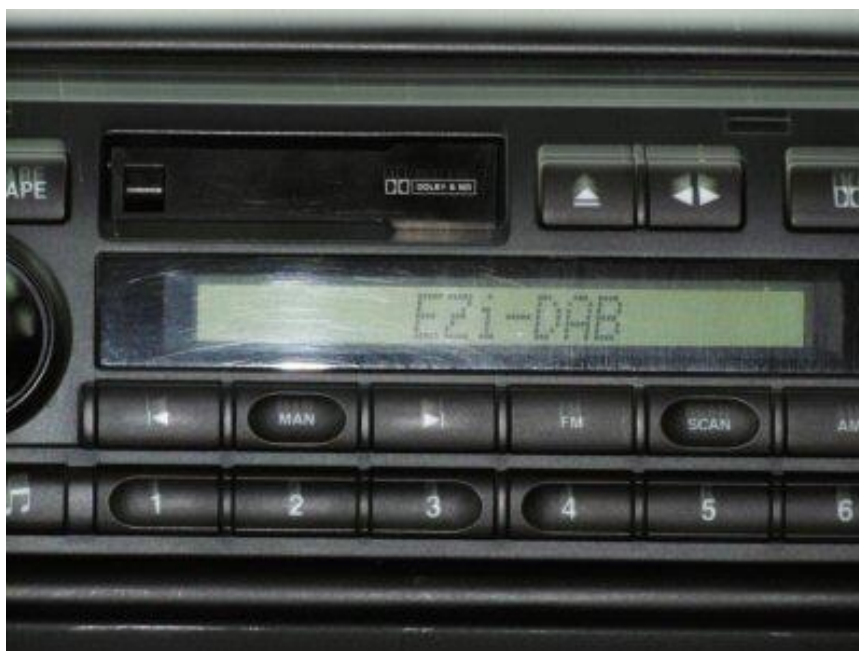
If you have RDS then your head unit will show that it's tuned to the EZi-DAB

I tend to think that for some but not all people this might be a reasonable way forward, it future-proofs your listening with the latest DAB radio while still retaining your existing FM system, whether it's original or aftermarket. By being able to connect a mobile phone it also give you the capability of connecting to internet radio and streaming services or your own .mp3 playlists and since the only major change to the existing ICE system is a "loop through" in the aerial line, the original remote volume controls will continue to work as they were intended, as does the CD auto-changer/player, amplifier and even the tape player and medium and long wave steam wireless.