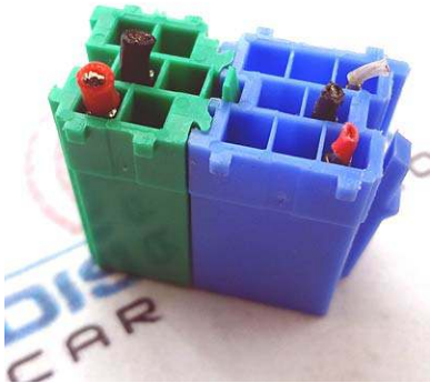
Fig. 5 mating plugs