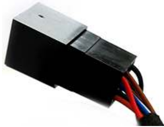
Fig. 4 harness connector