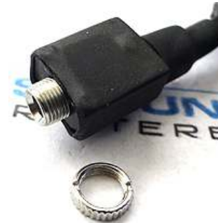
Fig. 6 Audio Jack

3.5 ft.). This location will vary based on vehicle and customer's preference.